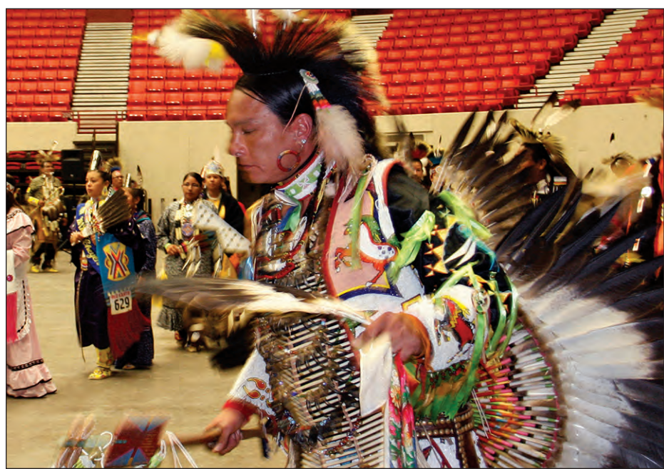
FANCY DANCERS: Dancers compete for prize money during the 2012 Red Earth powwow in OKC.